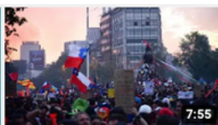
Le Chili : Un laboratoire constitutionnel